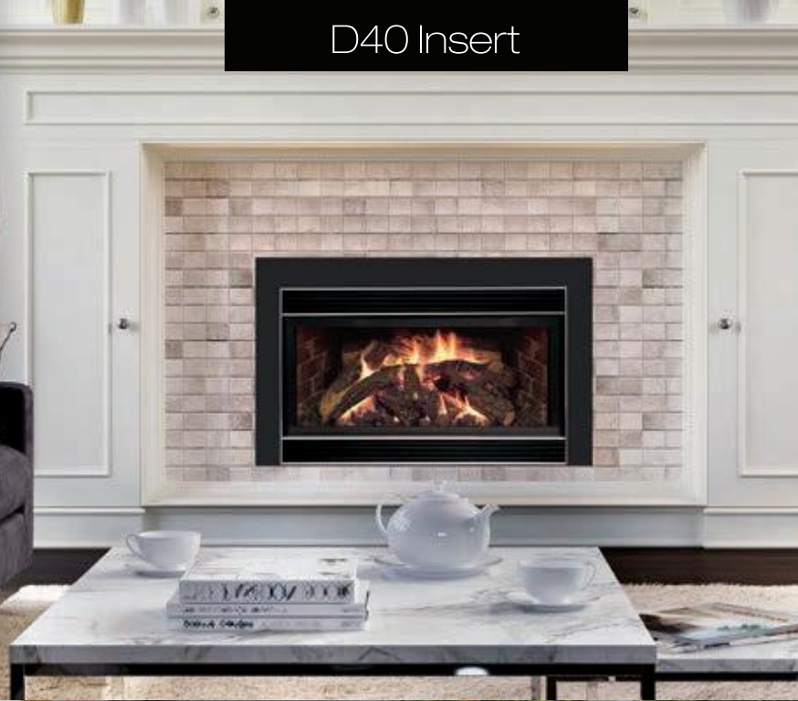
D40 with Premium Fiber Oak Log Set, Antique Red Firebrick Liner, and Contemporary Silver Millennia Front