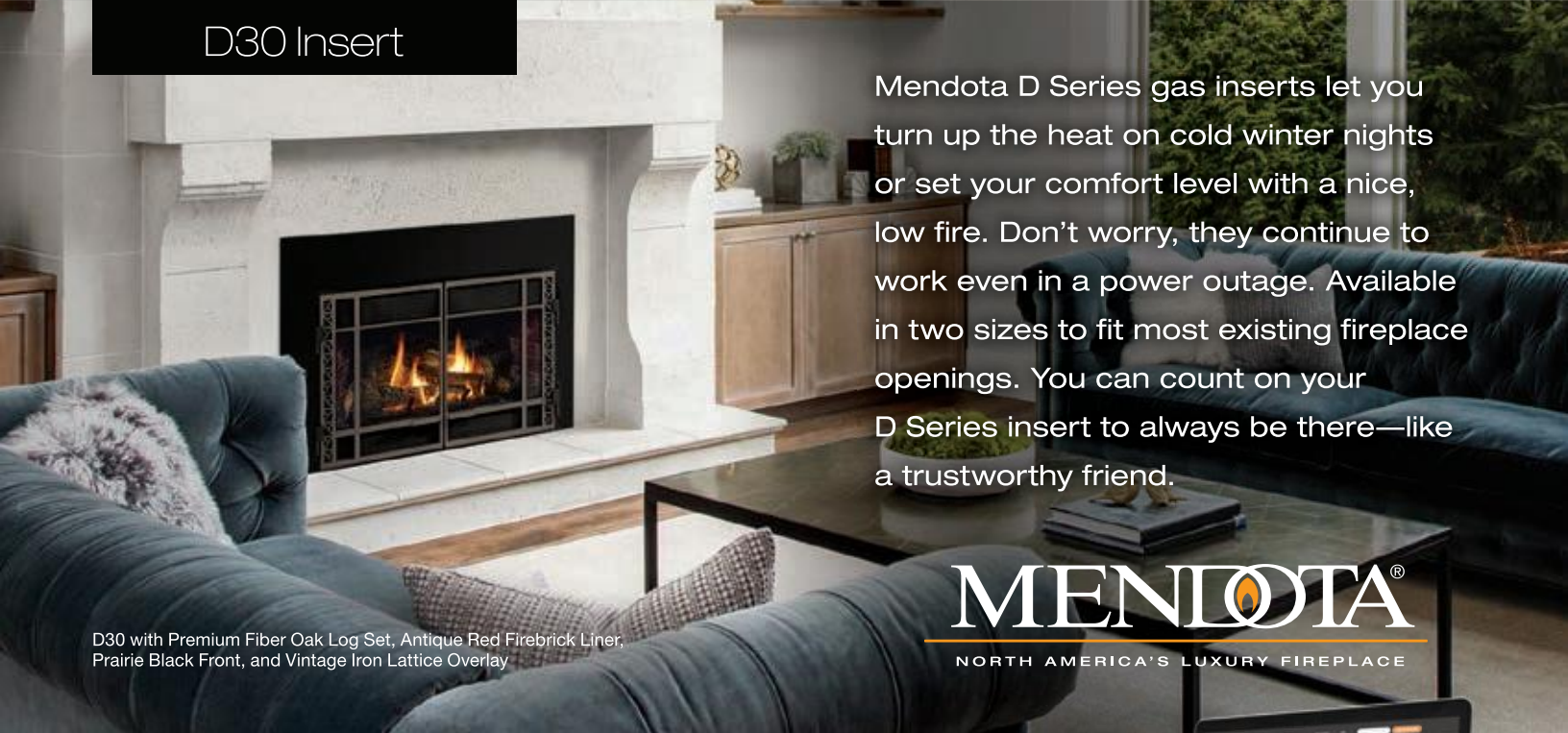
D30 with Premium Fiber Oak Log Set, Antique Red Firebrick Liner, Prairie Black Front, and Vintage Iron Lattice Overlay

Mendota D Series gas inserts let you turn up the heat on cold winter nights or set your comfort level with a nice, low fire. Don't worry, they continue to work even in a power outage. Available in two sizes to fit most existing fireplace openings. You can count on your D Series insert to always be there—like a trustworthy friend.