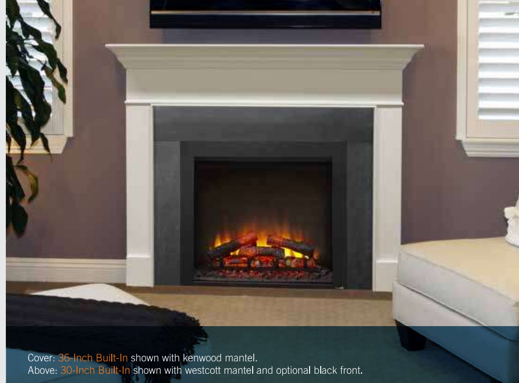
Cover: 36-Inch Built-In shown with kenwood mantel. Above: 30-Inch Built-In shown with westcott mantel and optional black front.