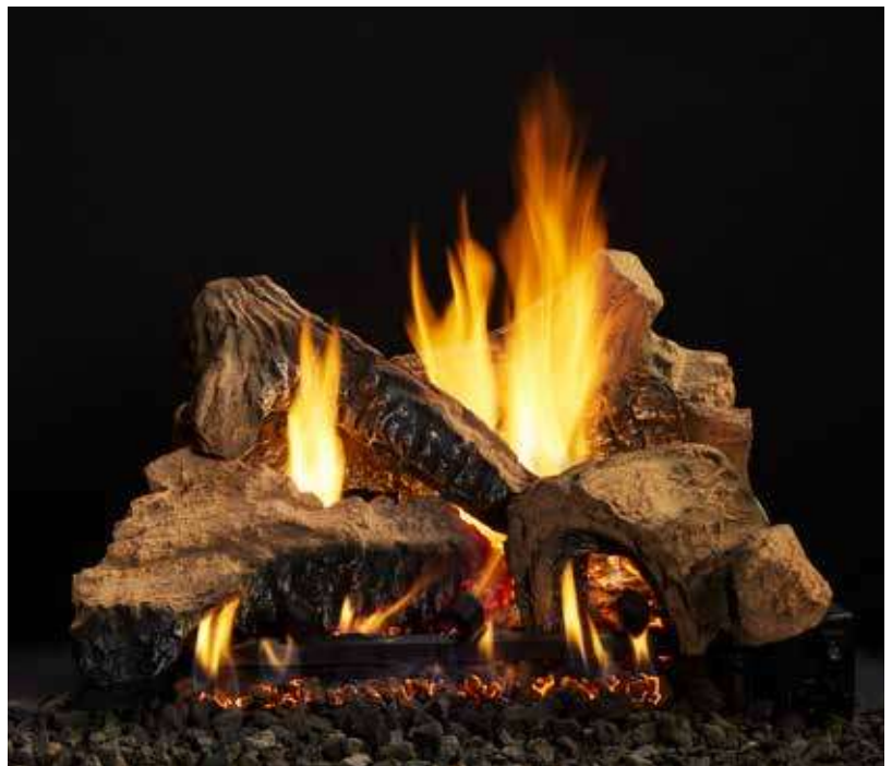
Duzy 2 - 24" Log Set