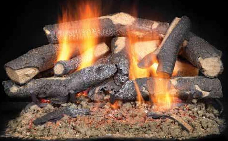
Fireside Supreme Oak - 30" Log Set

For a charred, mature fire, the 12-log Fireside Supreme Oak gas log set is stunningly realistic yet affordable. The detailed concrete logs, molded from real oak, are attractive even when not burning—also in a See-Through model that looks great from either side. In the Duzy 3, durable, glowing logs are convincing while radiant heat technology distributes penetrating warmth with no fan needed.