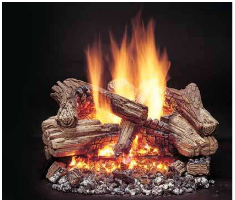
Duzy 3 - 24" Log Set