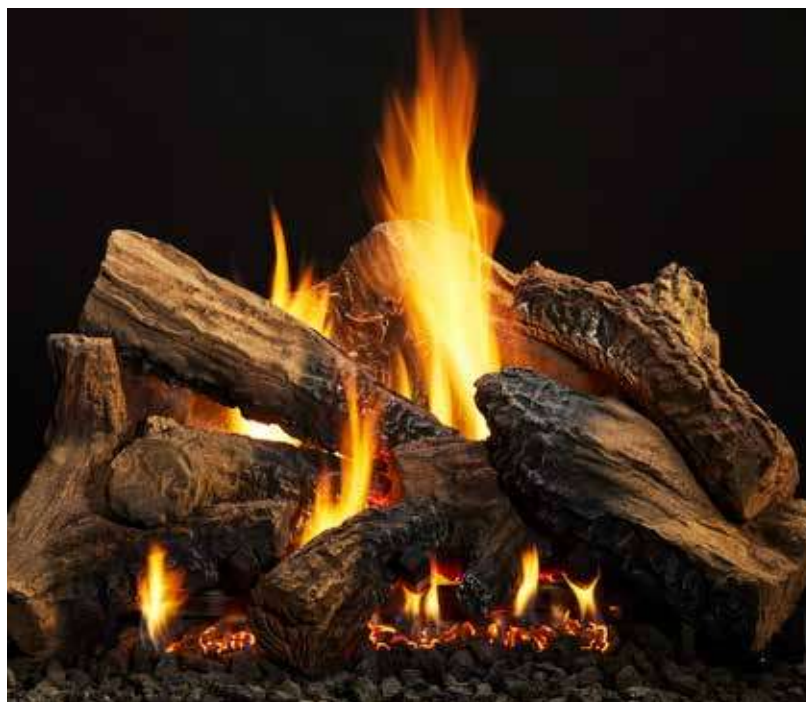
Duzy 5 - 24" Log Set