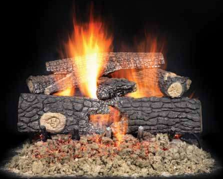
Fireside Realwood - 24" Log Set

Beautiful logs create a beautiful fire, but they don't have cost a lot. The Fireside Realwood gas log set adds bona fide appearance with eight detailed logs at a value price. An Outdoor model features a stainless-steel grate and burner elements to handle the elements. The Duzy 2 fits even narrow wood-burning fireplaces with four ceramic-fiber logs and our patented Natural Flame stainless steel burner, while the Campfire set recreates a natural look with 10-11 ceramic fiber logs.