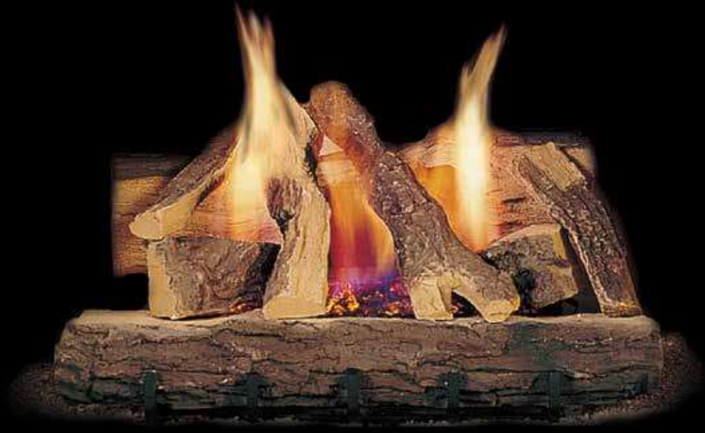
Campfire - 30" Log Set