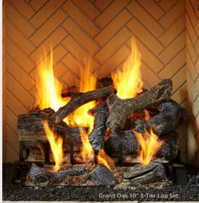
Grand Oak 30" 3-Tier Log Set

You get the look of a traditional, open-hearth fireplace plus the cleanness of gas with touch control. A gas log set doesn't overheat the room or require any change in the appearance or structure of your fireplace. Instead it delivers a realistic, room-enhancing fire at any moment, any day of the year.