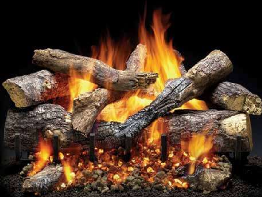
Grand Oak 24" 2-Tier Log Set

For larger fireplaces, the Fireside Grand Oak vented gas log set showcases 11-12 authentic logs from real oak timber molds. An ultramodern burner system creates a multi-level fire. The Outdoor version has such a beautiful fire, friends may ask if they can add a log to it. For gas logs with radiant burner technology, add outstanding realism with the Duzy 5's eight true-to-life ceramic logs, pushbutton ease and Natural Flame™ look.