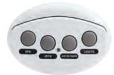
iS4 4-Function Spa-Side Remote