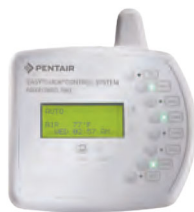
EasyTouch System Wireless Controller