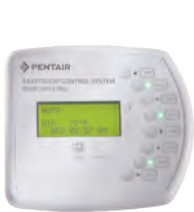
EasyTouch System Indoor Control Panel (4- or 8-Function Control)

EasyTouch systems are available for a separate spa, a separate pool, or a pool/spa combination with shared equipment. You select from systems that control four or eight accessory functions. Four-function systems are typically used to control pool and/or spa operation plus pool or spa lights and heaters. Eight-function systems allow separate scheduling for additional features, such as landscape lighting, waterfalls, fountains, additional heaters and more. Take the work and worry out of scheduling and operating pool and spa heating, filtration and cleaning cycles. For even greater convenience, you can add any of these optional controllers: