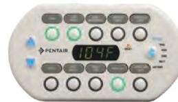
SpaCommand® Spa-Side Remote 10-Function Spa-Side Remote